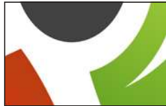
.eps, .ai, or .pdf

(Recommended for all products) Can be scaled to any size while maintaining quality. Also known as line art. Vector artwork is preferred, unless printing photos.