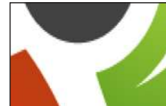
.psd, .tif, .jpg, .bmp, .gif